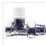
THERMOSTATIC VALVE ARCO 1/2"