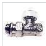
LOCK-SHIELD VALVE ARCO 1/2"