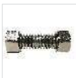
FLEXIBLE STEEL HOSES HITTE, 1/2"