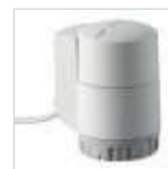
ELECTRIC ACTUATOR SIEMENS STA 73 AC/DC 24 NC