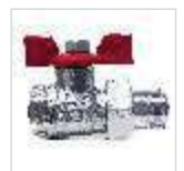
BALL VALVE ARCO 1/2"

Attention! Due to the continuous development of products, the manufacturer reserves the right to make additional changes without prior notice.