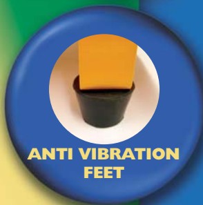
ANTI VIBRATION FEET