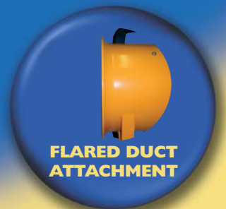
FLARED DUCT ATTACHMENT

WELDING BOOTHS • FACTORIES • FOUNDRIES LABORATORIES • ROOF SPACES • JOINERY SHOPS MARQUEES • UNDERGROUND • ENCLOSED SPACES