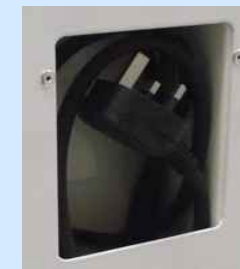
Recessed Cable Pocket