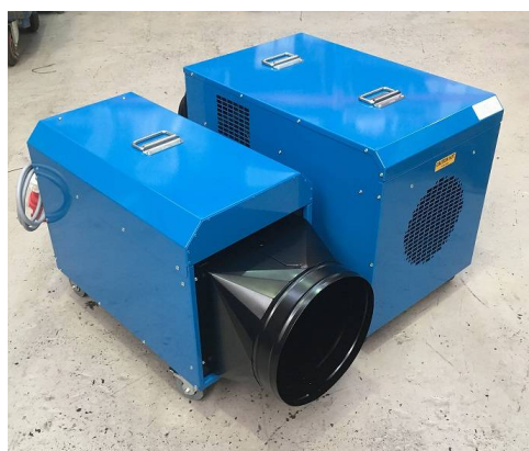
FFHT32 compared to the FF29