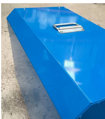
Contoured stylish design