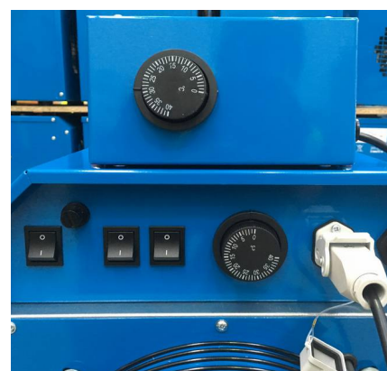
Easy to use controls, including fan & heat settings, over temperature reset and remote thermostat port

Customer Order Line 01527 830610 Technical Advice 01527 830616 E: sales@broughtoneap.co.uk F: 01527 527558