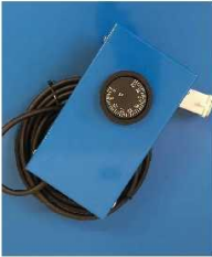
Remote thermostat (optional extra)