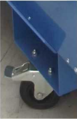
Lifting eyes for maximum portability