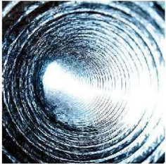
10m 500mm duct (optional extra)