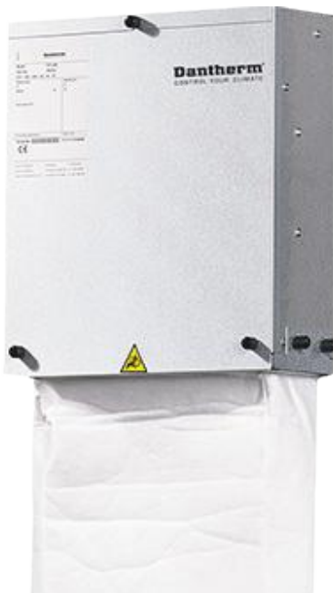
DFC 350 DFC 450