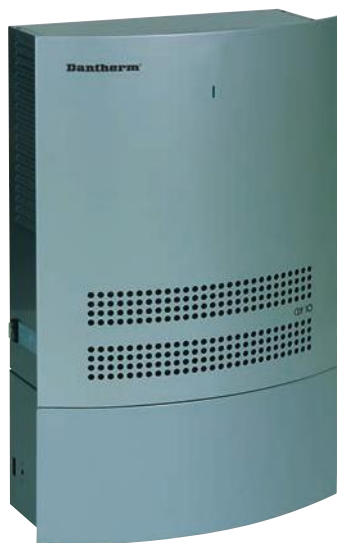
CDF 10 with water tank