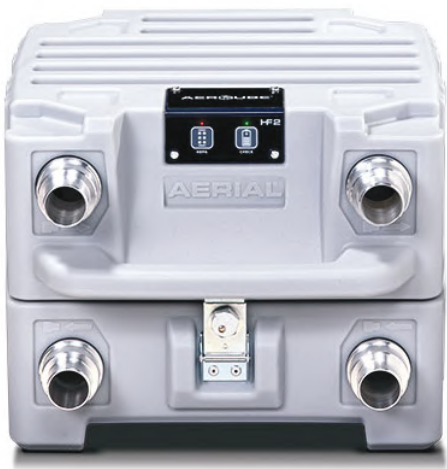
AERCUBE HEPA FILTER SYSTEM – HF 2