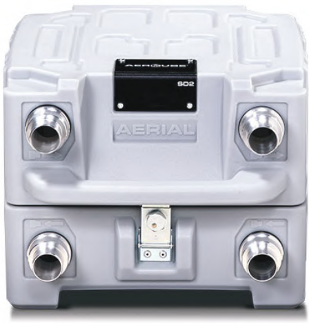
AERCUBE SOUND ABSORBER – SD 2