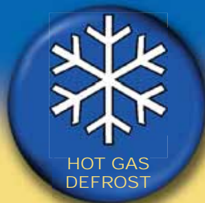
HOT GAS DEFROST