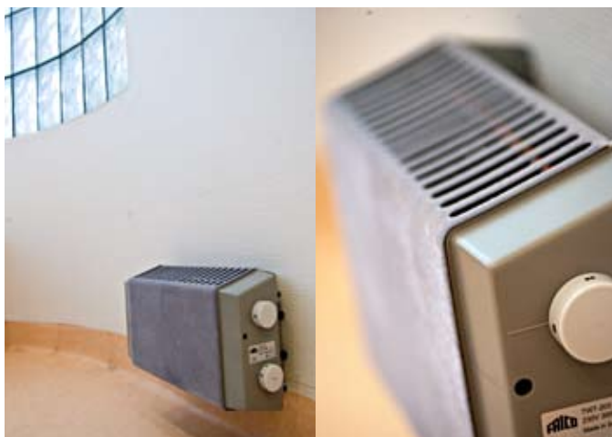
The grey covered front panel gives a low surface temperature and TWT200 is therefore recommended for .e.g. bathrooms.