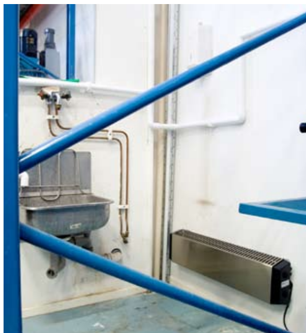
In the stainless steel design Thermowarm withstands corrosive environments.