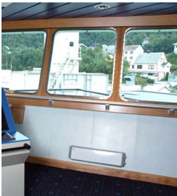
The small size and effortless installation make Thermowarm easy to position even in confined areas such as a control cabin.