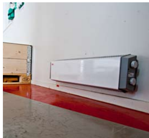
Thermowarm is available with a white front, with or without a circuit breaker.