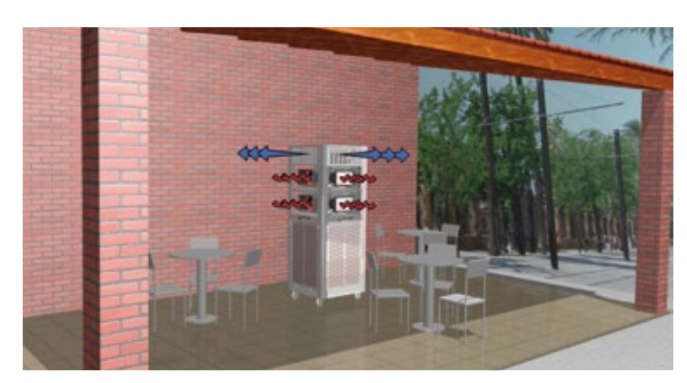
EXAMPLE OF INSTALLATION FOR COOLING IN SUMMER AND INSTANT HEAT IN WINTER USING INFRARED LAMPS.