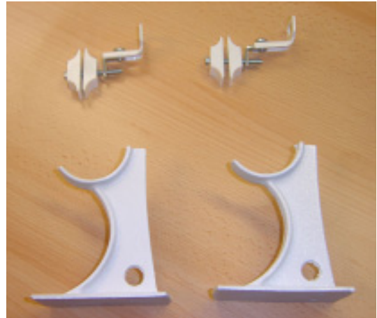
Floor mounted with retaining stays (optional extra).