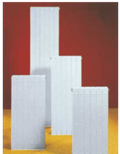
Graduate & Highrise